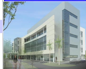
UF&Shands at Springhill NW 39th Avenue and I-75

OB-GYN Alumni Society/ Resident Research Day/ Graduation Weekend 2016 Gainesville, Florida June 24-25, 2016