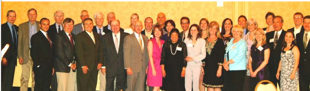
Alumni and Faculty of the Department of OB-GYN