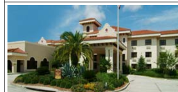
Best Western Gateway Grand Gainesville, Florida June 14-16, 2013